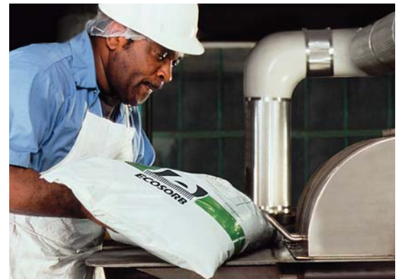
Refinery operator adding ECOSORB product into the Precoat Tank.

Filtered Liquor: Conc-40 brix, Temp-70°C, Turbidity-3-4NTU, Color- ≤35RBU