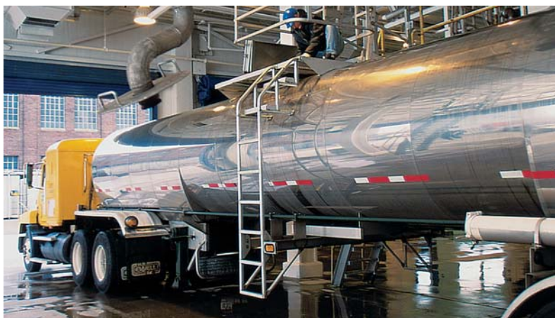
ECOSORB products keep liquid sugar operations running smoothly and efficiently.

Because liquid sugar is less stable than crystalline forms refineries and melt stations often use a polishing step to meet their customers' high quality standards after shipping and storage. The data in the table to the right is from a US refinery producing 65,000 metric tons of liquid product(s) annually. By switching from batch PAC to precoat operation with ECOSORB S-405 the refinery was able to streamline its liquid sugar operation by eliminating the surge tanks and manpower needed for PAC and filter aid additions. Compared to the 4 to 5 hour filter cycles with PAC the 12-hour-plus filter cycles with ECOSORB S-405 have provided reliable and continuous service in this operation for more than ten years.