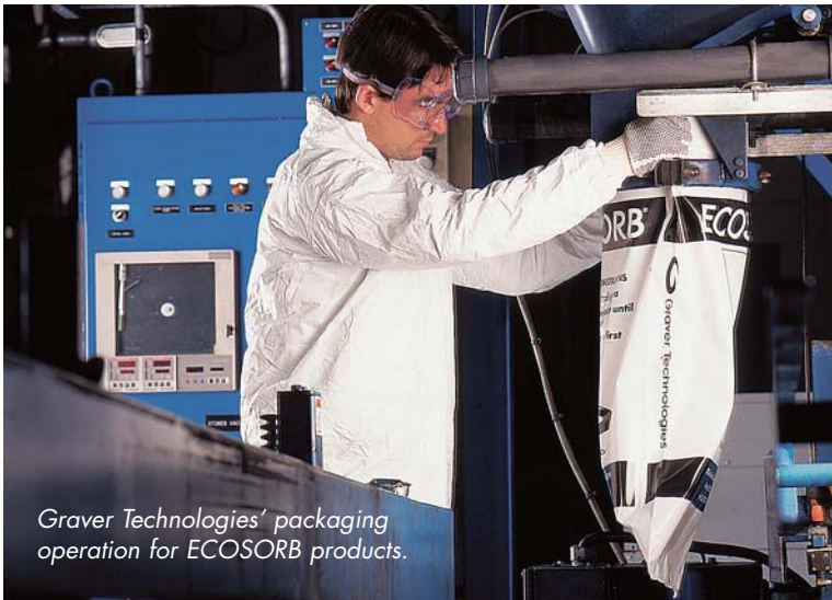
Graver Technologies' packaging operation for ECOSORB products.