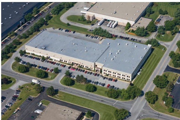
ISO-9001 Factory in Glasgow, DE U.S.A.

Whether your business is around the corner or around the world, Graver Technologies can support you with superior products and services.